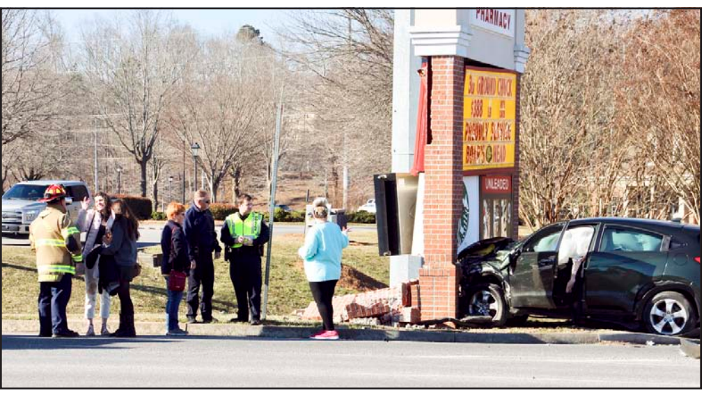
The brick Ingles sign at Georgia 515 sustained quite a bit of damage in this Jan. 30 afternoon accident, as did the crosswalk signal that was completely uprooted from the ground.

that. We stood there and talked to a hospital." about it, and nobody had to go The Ingles sign is